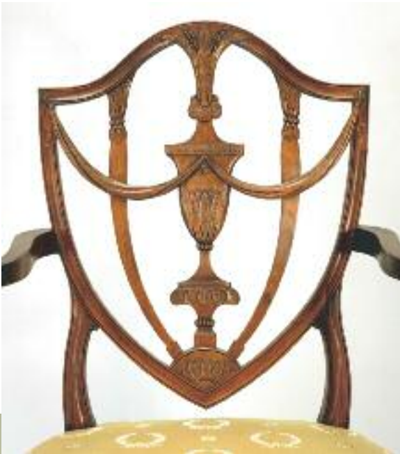
Exhibit photo (below, left to right)